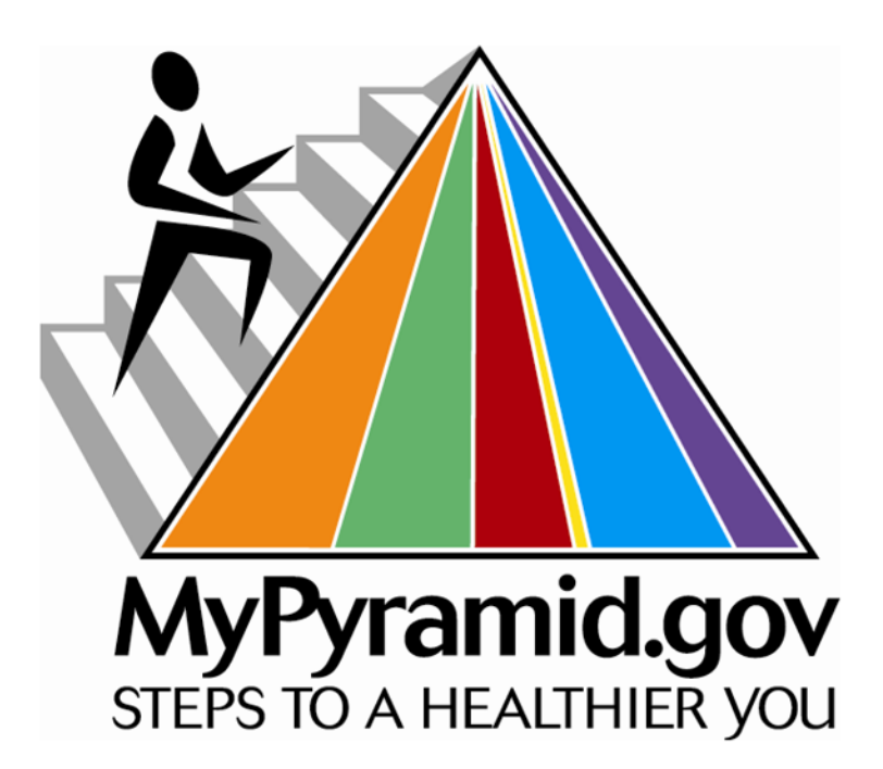
Figure 1. MyPyramid, designed by the USDA in 2006

The vertical stripes in MyPyramid.gov represent different food groups and their relative contributions to a healthy diet. The figure is meaningless without information from its corresponding Web site.